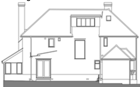
Existing North East Elevation